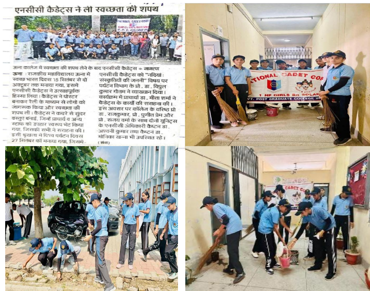
Figure 2. NCC Cadets Taking Swachhta Pledge and Conducting Cleanliness Drive.