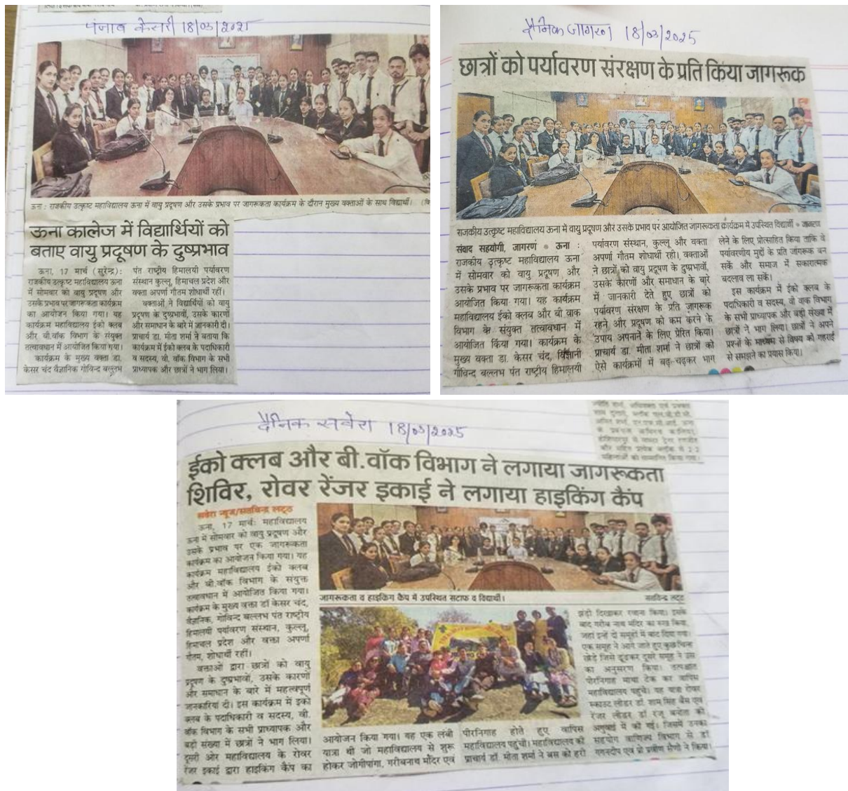
Figure 4. Glimpses of Awareness initiatives and Hiking Activities