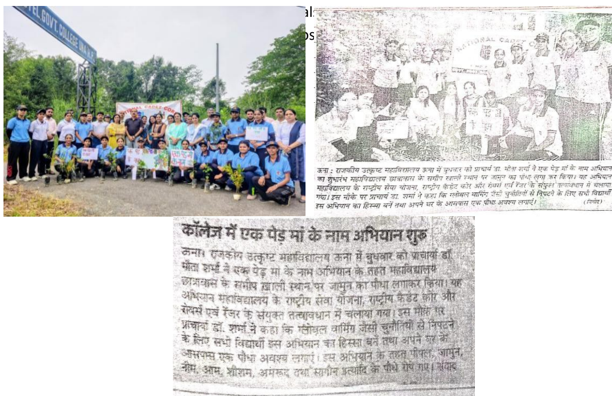
Figure 1. Students Participating in Campus Plantation and Eco-Awareness Activities.

The primary objective of this initiative was to contribute to environmental conservation by planting saplings and creating awareness within the community about the importance of trees.