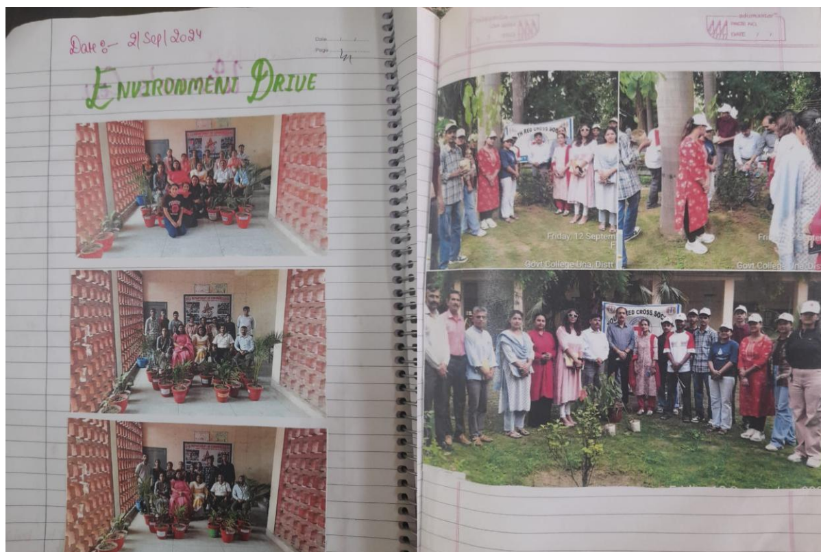
Figure 6. Environmental Awareness Drive Organized by Red Cross Society and College Committee.