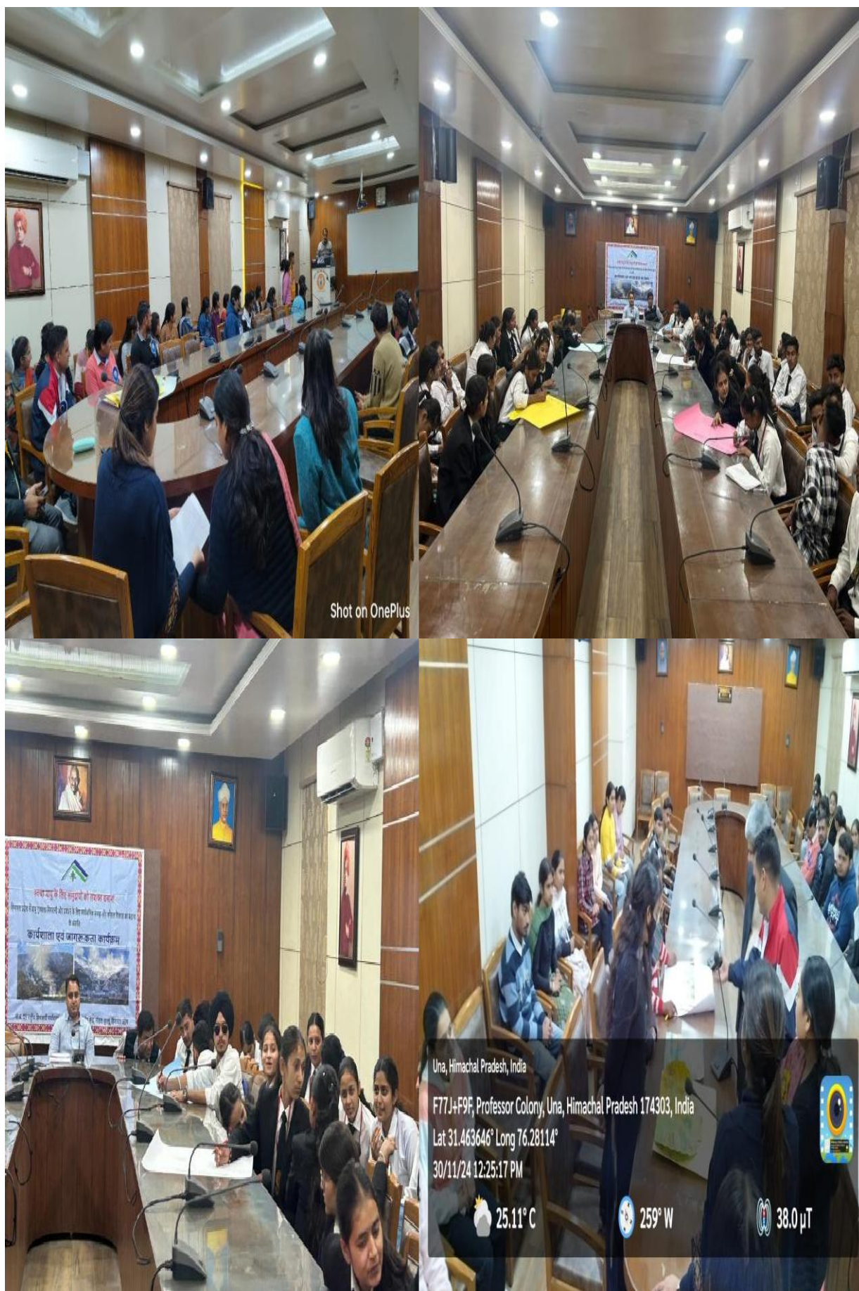
Figure 3. Interactive Seminar on Air Pollution and Environmental Responsibility.